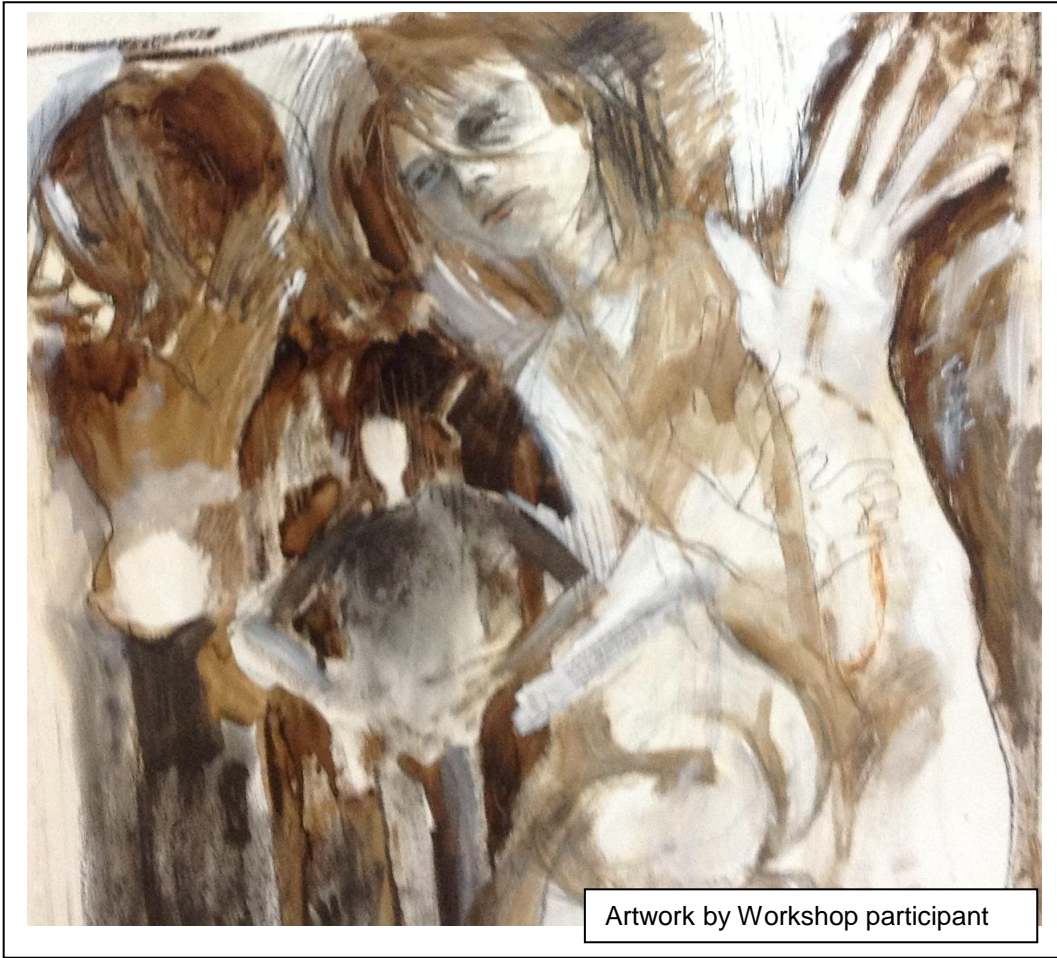
Artwork by Workshop participant